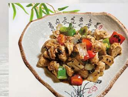
Black Bean Vegan Chicken