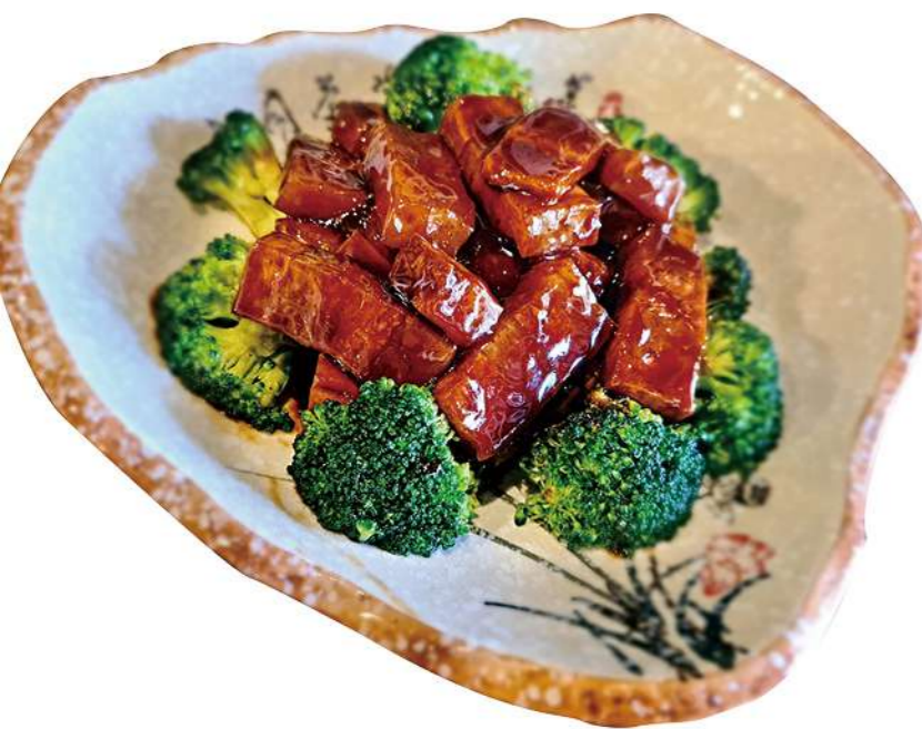
Red-Braised Vegan Pork with Potatoes