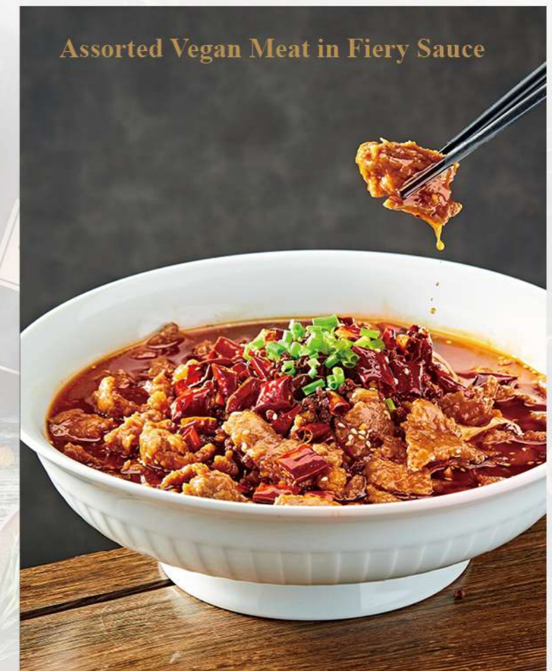
Assorted Vegan Meat in Fiery Sauce

素黑椒牛 19.95 tender vegan beef strips stir-fried with aromatic black pepper, offering a bold and savory flavor with a slight kick from the pepper