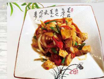
Sichuan Vegan Chicken