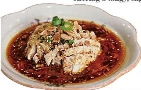
Mouthwatering Vegan Chicken

老醋木耳 12.95 wood ear mushrooms marinated in aged vinegar, offering a tangy, slightly sour flavor and crisp texture