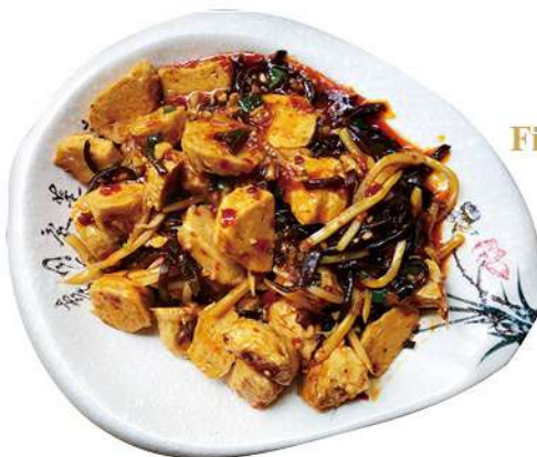
Fish-Fragrant Vegan Chicken

手撕包菜素鸡 19.95 tender vegan chicken stir-fried with hand-torn cabbage, offering a balance of juicy meat and slightly sweet, crisp vegetables