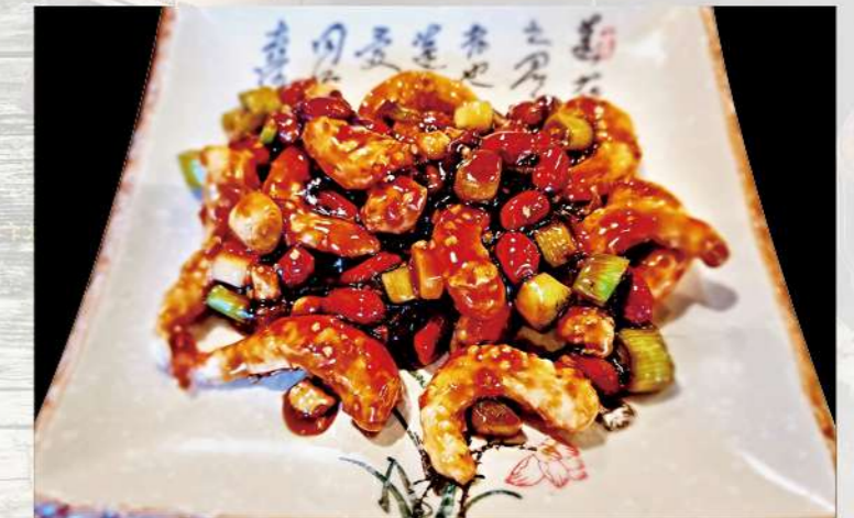
Gong Bao Vegan King Prawns