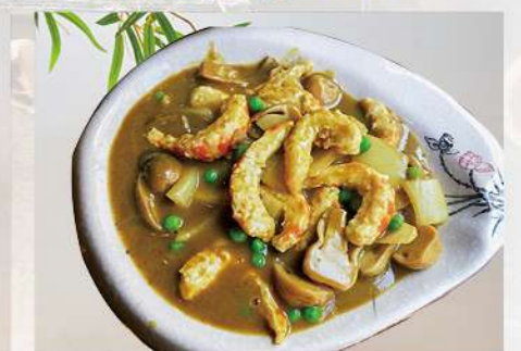
Vegan King Prawns Curry