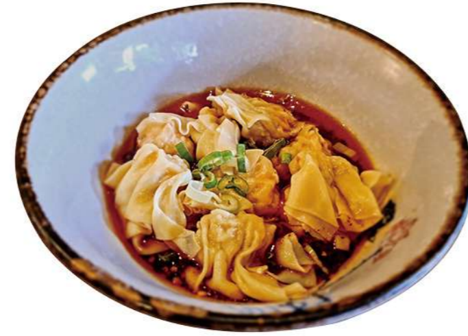
Vegetable Wontons with Chili Oil (10)

tender wontons with mixed vegetable, served in spicy chili oil