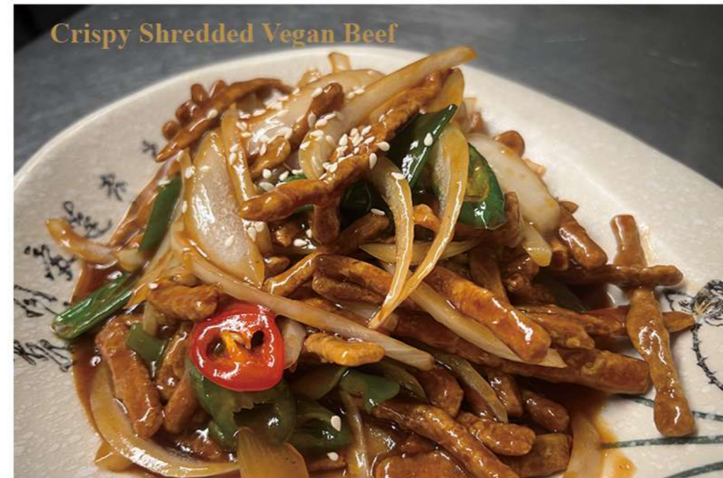
Crispy Shredded Vegan Beef