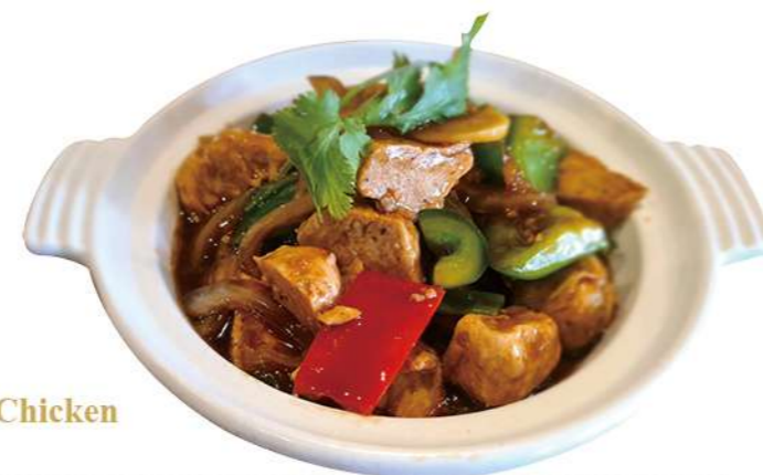
Three Cups Vegan Chicken