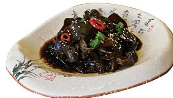
Wood Ear Mushroom with Vinegar