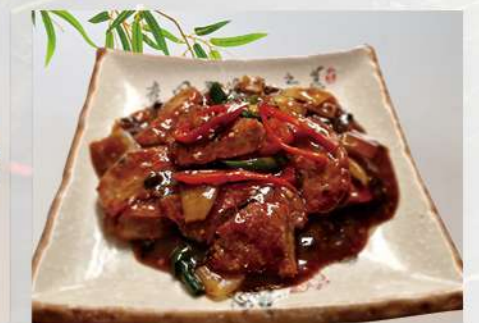
Black Bean Vegan Pork