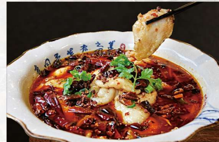
Vegan Fish in Fiery Sauce

vegan king prawns stir-fried in a dry wok with aromatic spices and fiery chili, delivering an unforgettable bold, spicy, and Sichuan-inspired experience